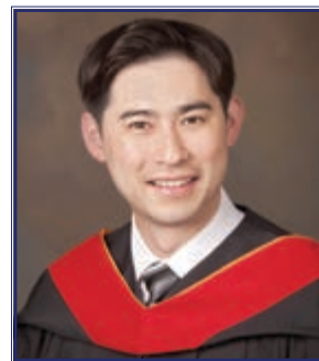
Ha Cho Cum Laude